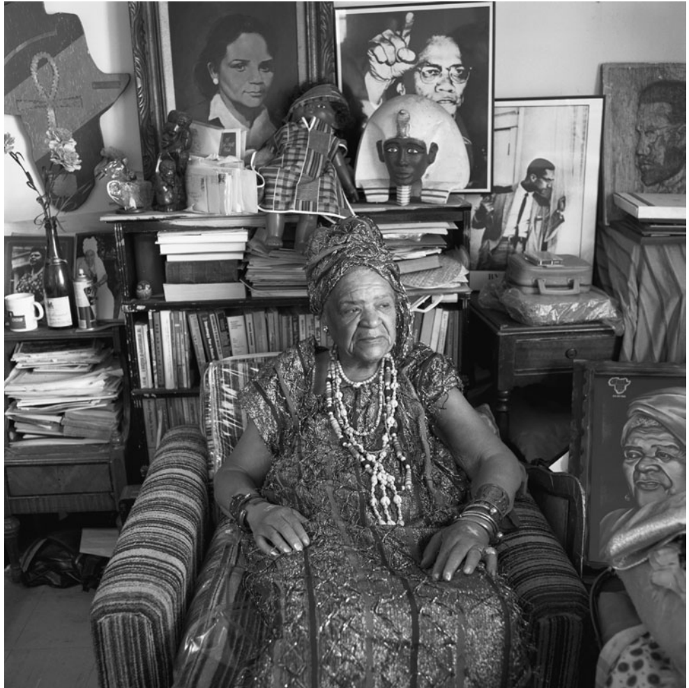
Queen Mother Moore (1898–1997) in an undated photograph. Queen Mother Moore was a legendary freedom fighter throughout the twentieth century, across Garveyite, communist, black nationalist, and pan-Africanist organizations. (“Queen Mother Moore” from Brian Lanker, I Dream a World: Portraits of Black Women Who Changed America [1989]; courtesy of Brian Lanker Photography)