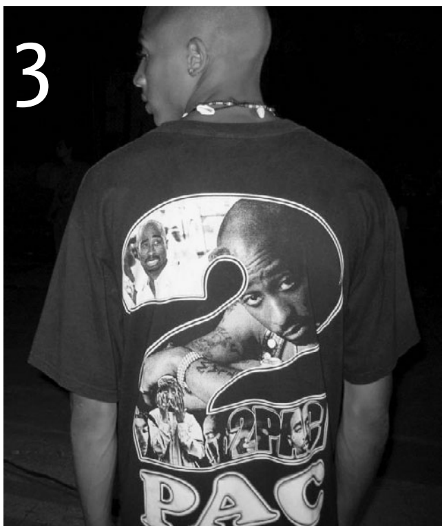
Tupac Shakur (1971–1996). Tupac Amaru Shakur, born in prison to a Black Panther mother, became an icon of resistance to black youth worldwide. He is shown here as lived by a hip hop fan at a rapero performance in Havana, Cuba, 2006.